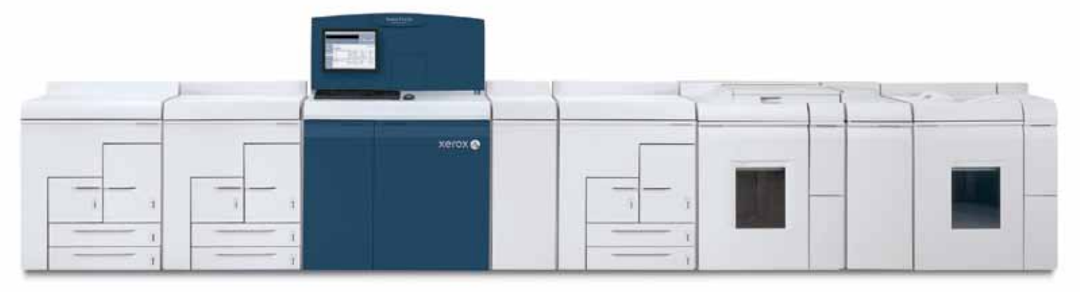
Xerox Nuvera® 144 MX Production System