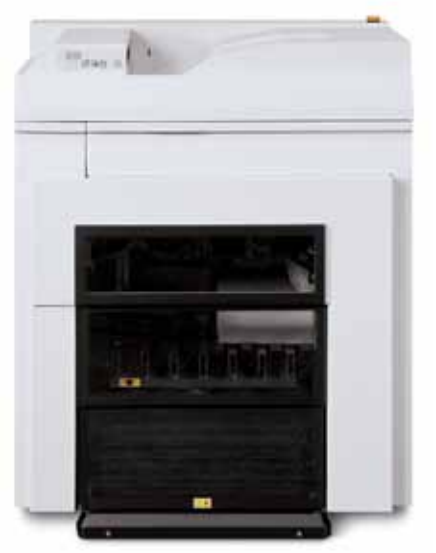
Xerox<sup>®</sup> Production Stacker

The Basic Finisher Module (BFM) stacks and staples documents and works well with all stackers in the finishing portfolio. All BFMs are capable of stacking up to 3,000 sheets (20 lb/75 gsm) and can staple up to 100 sheets, using one or two staples. The BFM comes in a tandem configuration for those who need maximum productivity for stapled sets. The BFM+ and BFM-Direct Connect can also pass paper to downstream third-party finishers or any stacker in the Xerox Nuvera finishing portfolio.