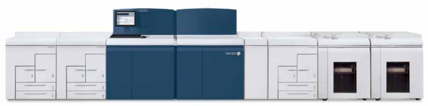
Xerox Nuvera® 288 MX Perfecting Production System